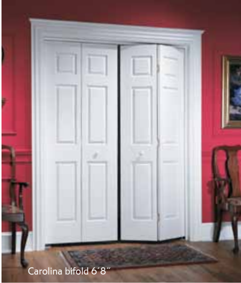
Carolina bifold 6'8"