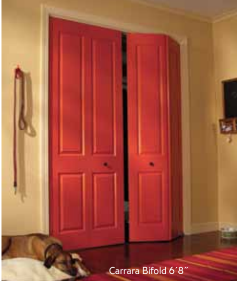
Carrara Bifold 6'8"

Austere yet welcoming, this uncluttered design has broad appeal.