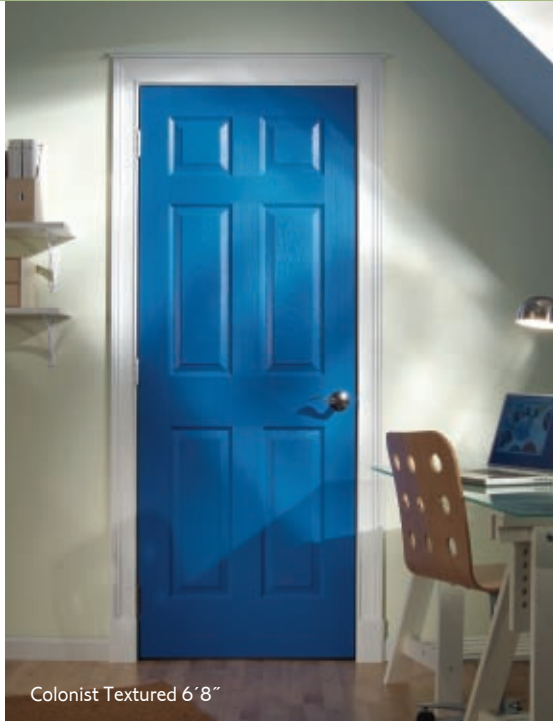
Colonist Textured 6'8"