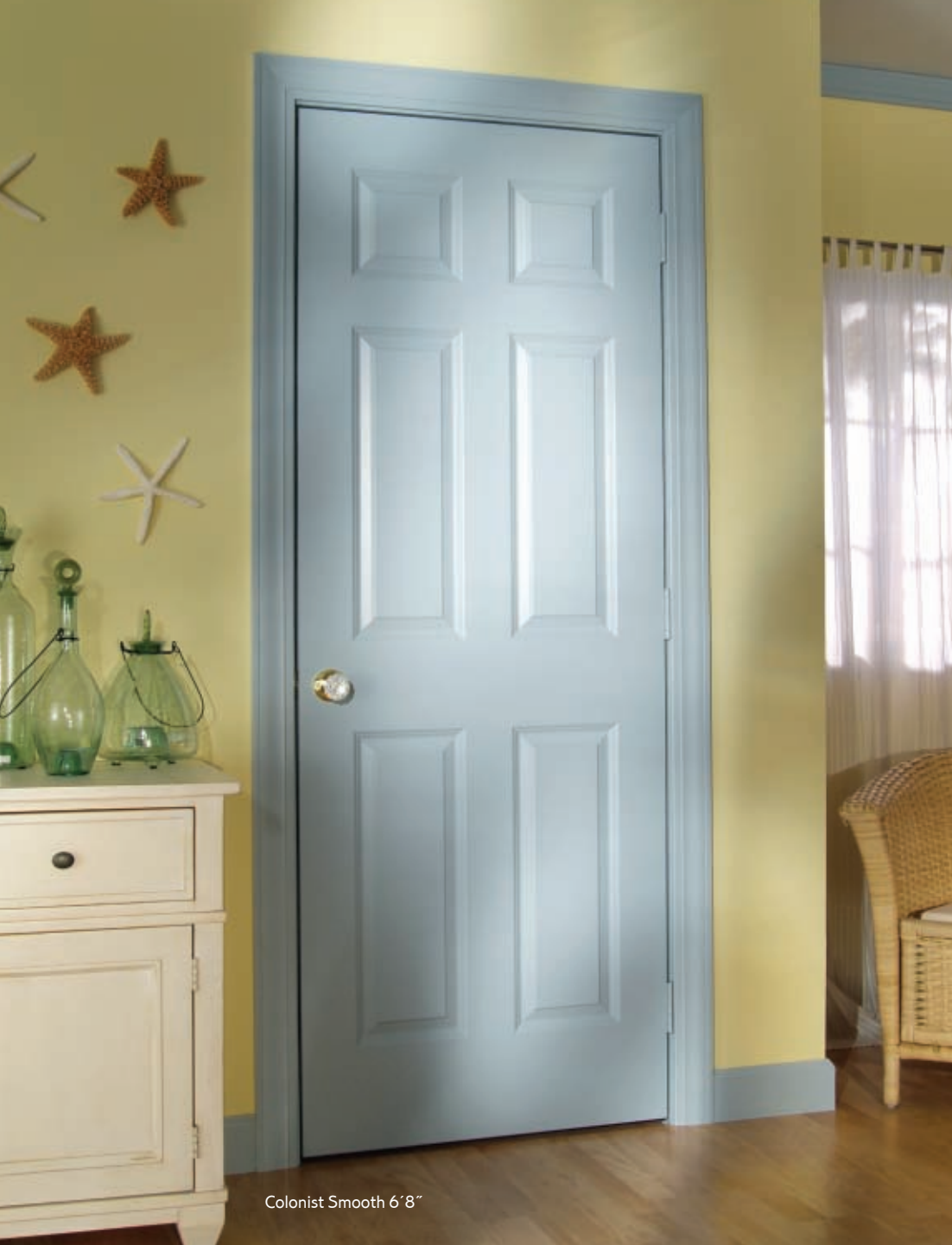
Colonist Smooth 6'8"