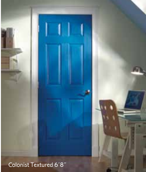
Colonist Textured 6'8"

Distinguished by more than a quarter century of precise craftsmanship, this classic design rises above all imitators.