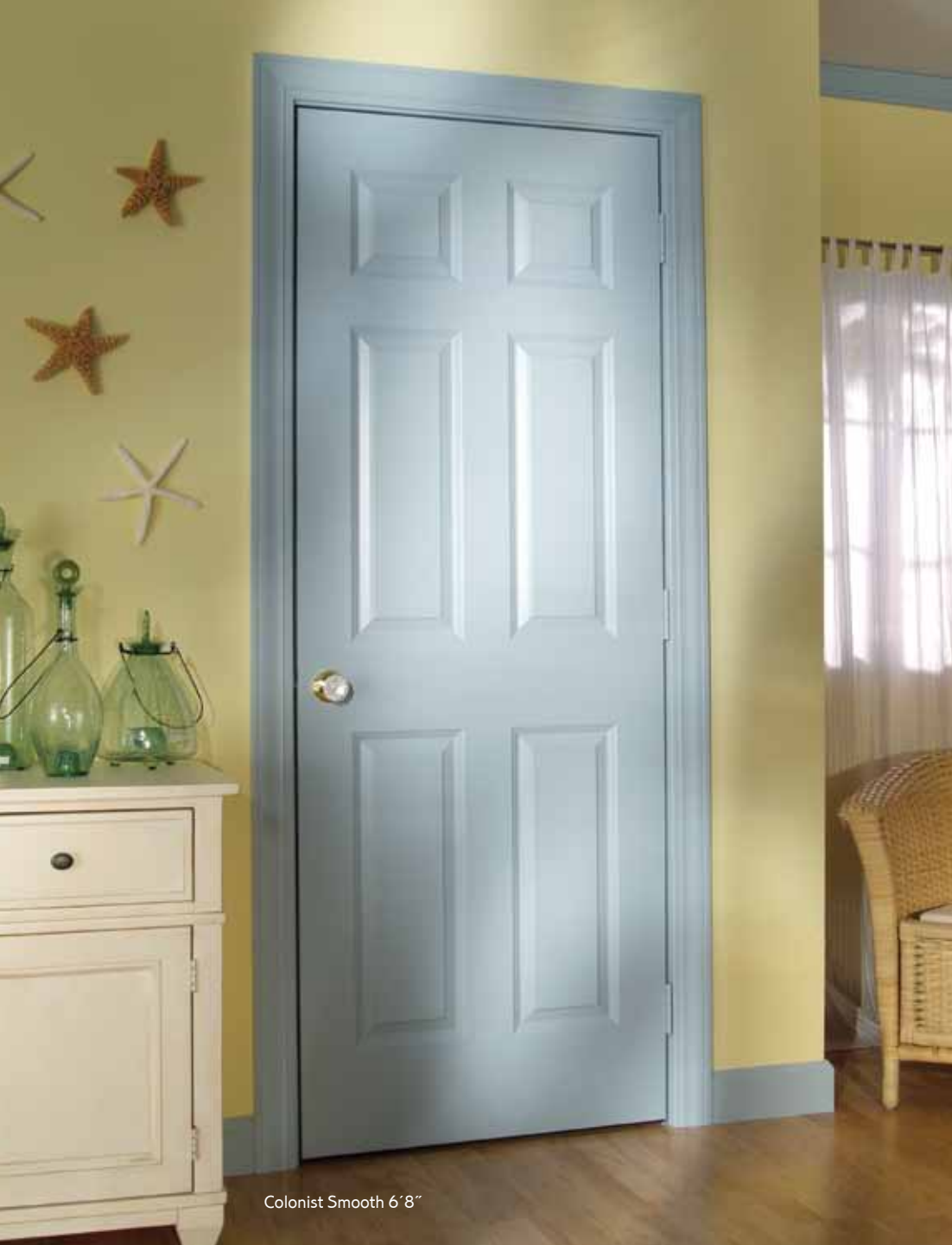
Colonist Smooth 6'8"