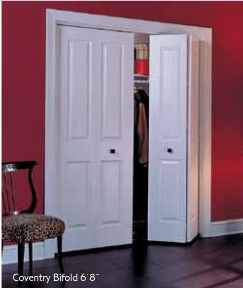
Coventry Bifold 6'8"

A classic design that has both a unique character and a universal appeal.