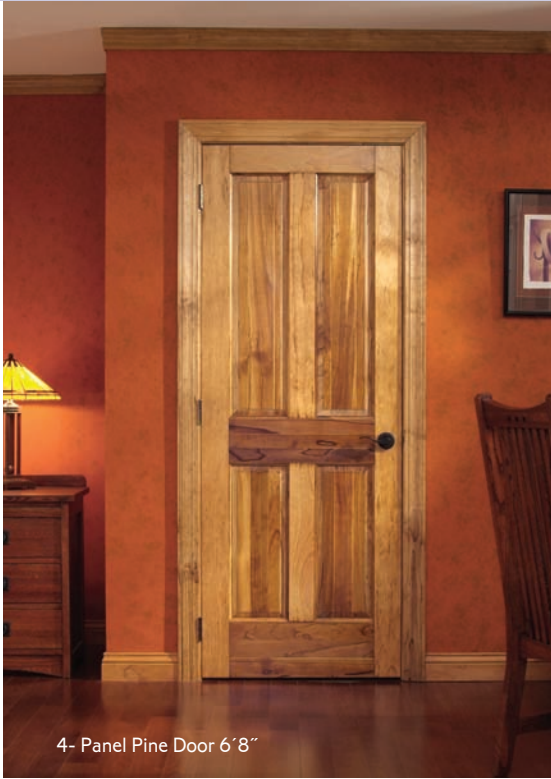
4- Panel Pine Door 6'8"

Enjoy the warmth and versatility of CraftMaster Pine Doors.