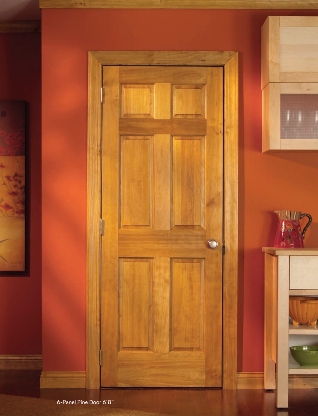
6-Panel Pine Door 6'8"