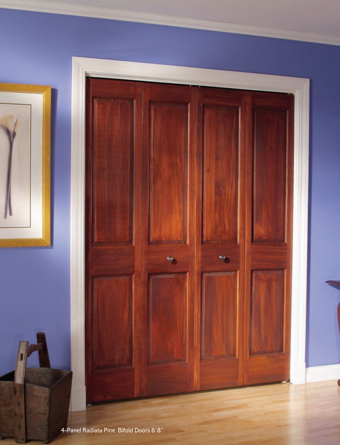
4-Panel Radiata Pine Bifold Doors 6'8"