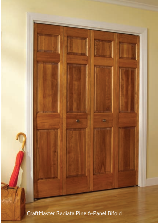
CraftMaster Radiata Pine 6-Panel Bifold

CraftMaster Radiata Pine Doors offer elegance in a space-saving bifold design.